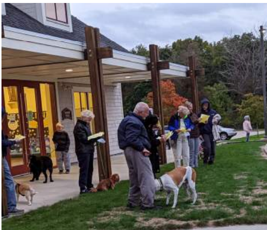
Blessing of the Pets was held on Monday, October 3, 2022 on the eve of the feast day of St. Francis of Assisi.