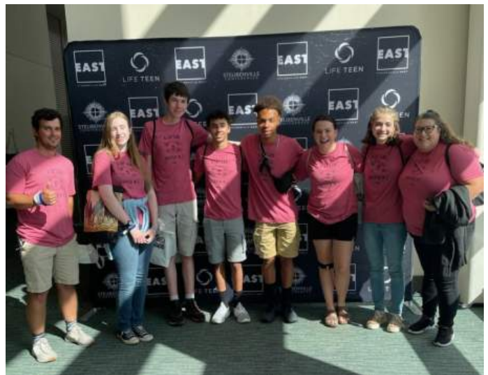
Teens from St. Bernard's who attended Steubenville East Program last weekend.